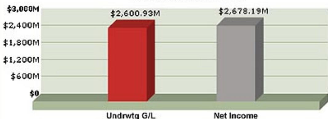
Net Income to UW Gain/Loss